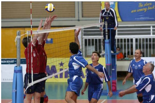
European Veterans Volleyball Championship