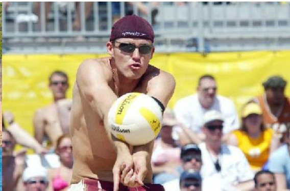
European Beach Volleyball Championship U18 (2008)