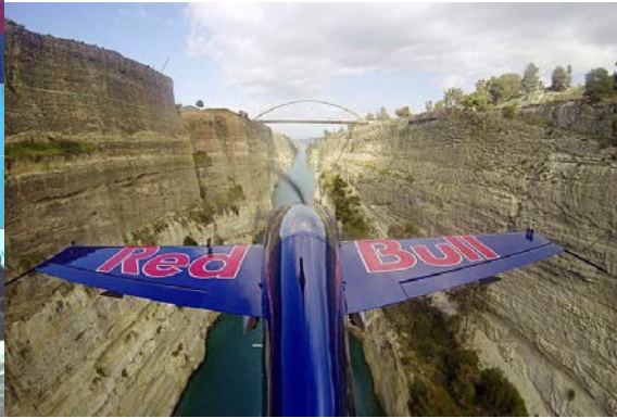
Red Bull Air Race (2014)