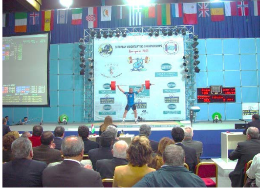
European Weightlifting Championship (2003)

Loutraki is an acclaimed sports tours destination providing the ideal conditions for both professional and amateur athletes training camps and sports events.