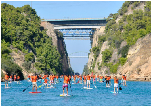
3rd Hellenic SUP Cup 2013