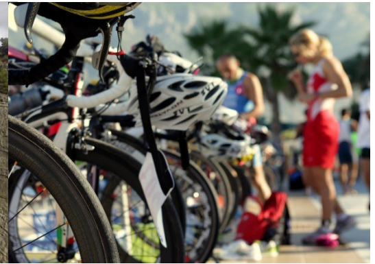
European Triathlon Cup (2010)