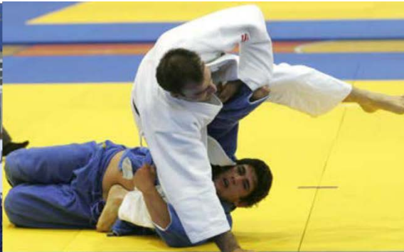
International Judo Tournament "Acropolis"