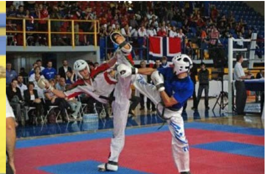
14th Balkan Karate Championship (2010)