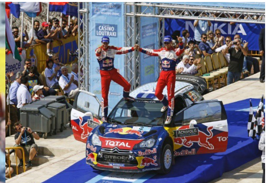
WRC Rally Acropolis